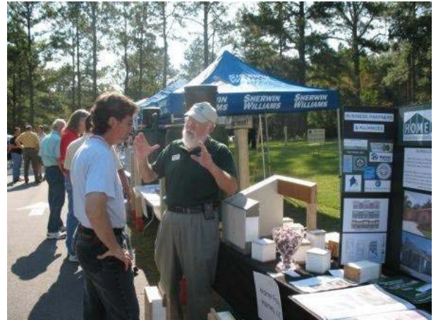
Residents check out the displays at the 2008 Green Living Expo. The event is back this Saturday and will feature an even larger array of exhibits, organizers say.

For more about the Green Living Expo and a list of exhibitors, visit the TBA's Green Building Council Web site at www.tallahasseebuilding.com or the association site at www.tallyba.com .