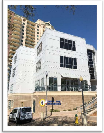
Center for Innovation