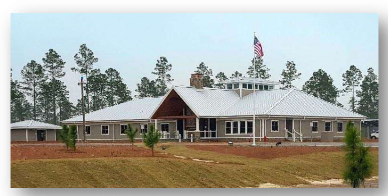
Wakulla Environmental Institute