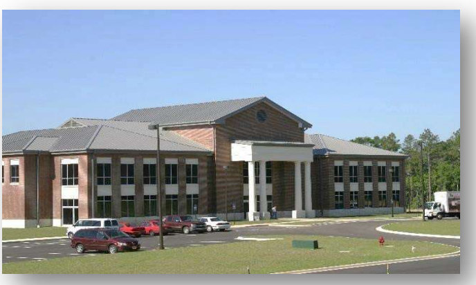
Florida Public Safety Institute Pat Thomas Law Enforcement Academy